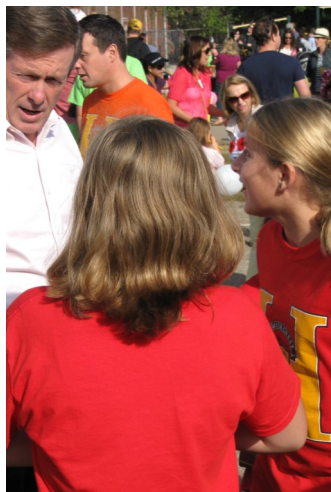
Mayor John Tory spent time talking to students following the Opening ceremony